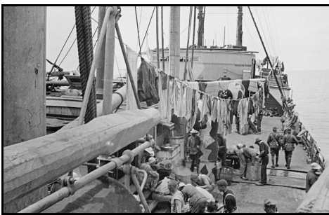
Washing day on the Boonah

The full collection of Norman Gillies' photos can be viewed online at http://empirecall.pbworks.com/w/page/139892598/HMT-Boonah-quarantined-at-Torrens-Island%2C-1919