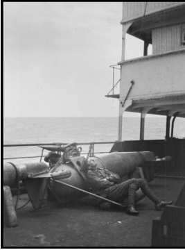
Snoozing on a paravane, Boonah