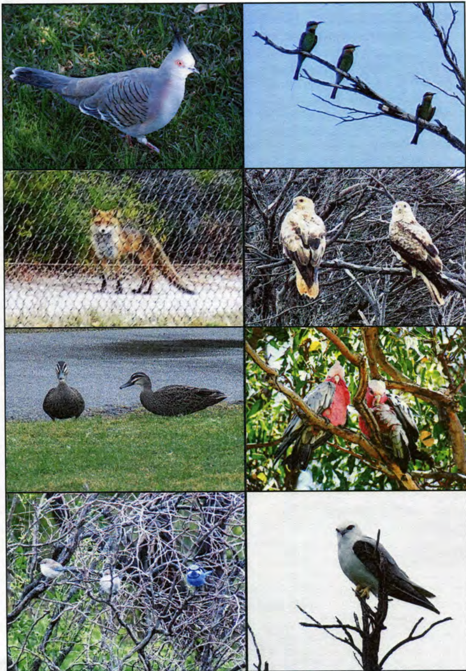
Photographs taken at Woodman Point 2013