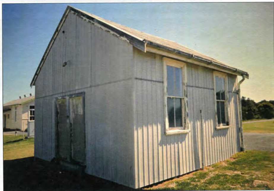
The Changing Hut [c1931] The fence which bounded the IH originally abutted each side of the hut. Medical staff would be required to take a Lysol bath in this building before leaving the IH compound.