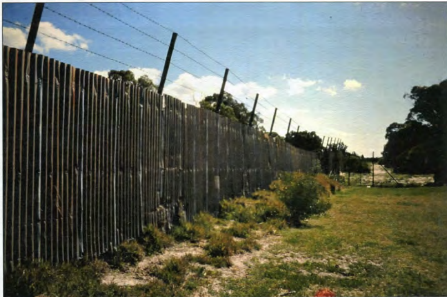
The original galvanised corrugated fence of the Woodman Point Explosive Reserve. Photograph depicts the area directly behind the Gatehouse Residence [now demolished]