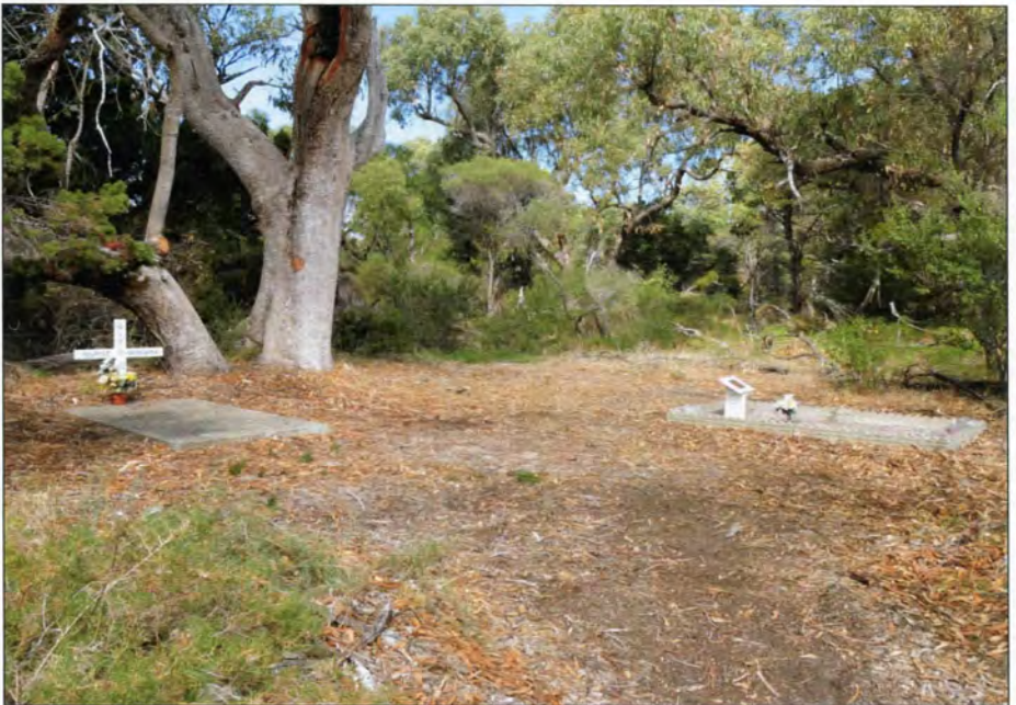
Woodman Point Regional Park Military Cemetery To this in 2016 - see cover image.