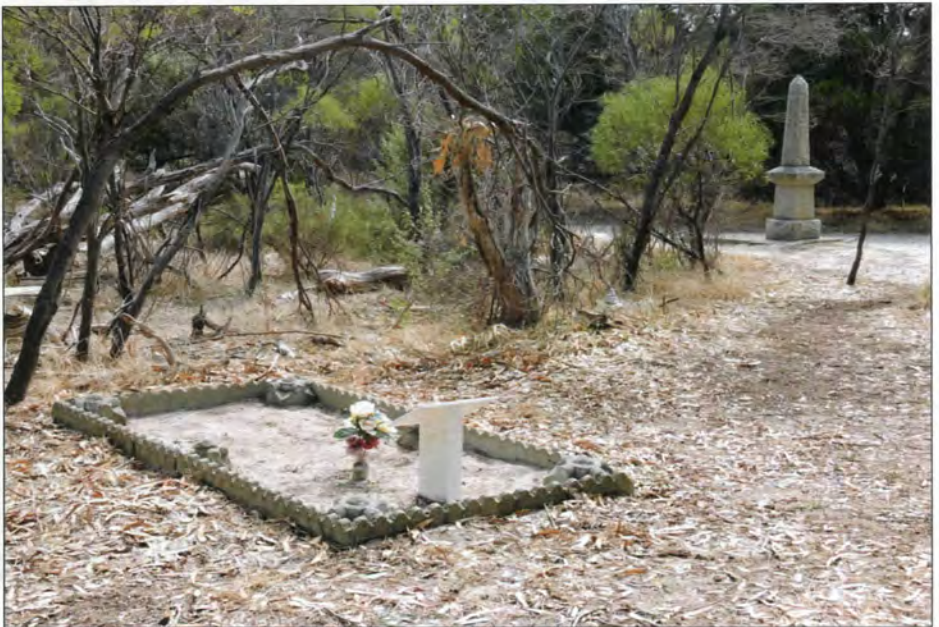
The SS Suva grave shown foreground with the Rosa O'Kane Memorial grave in the rear.