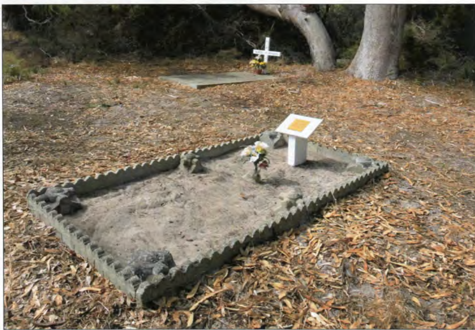
The grave of four Fijian crewmen off the vessel SS Suva, who died of Smallpox in 1943