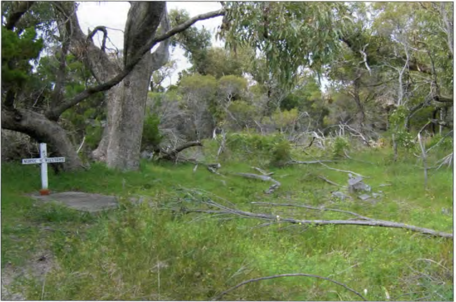
Woodman Point Regional Park Military Cemetery From this in 2015